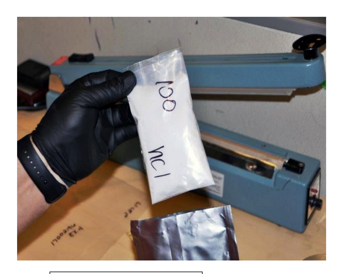
Figure 3: Fentanyl in powder form.