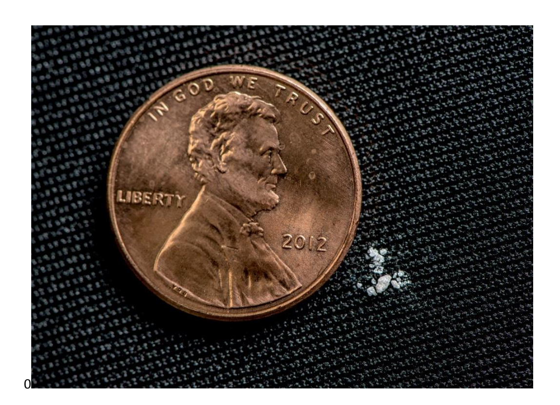
Figure 1 : Two – three milligrams of fentanyl: A potentially lethal dose.