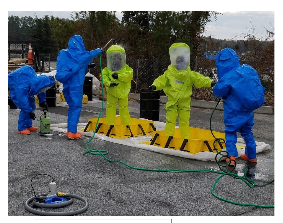
Figure 4 : Decontamination procedures: Full Personal Protection Equipment (PPE)

File Nr: 2017/202335-1 Page 4/5 Control Nr: P-693/09-2017